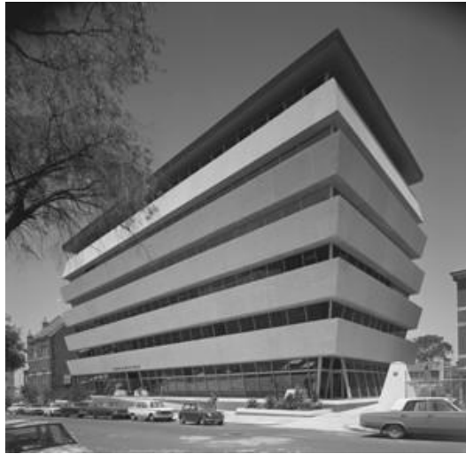
Western Australian Museum at Francis Street Northbridge, opened in 1972.

new herbarium in 2010 the building housed several unique collections of plants, an extensive research library and database. Since the construction of the new herbarium, the collections have been relocated to the new premises, and the Kensington facility has been decommissioned.