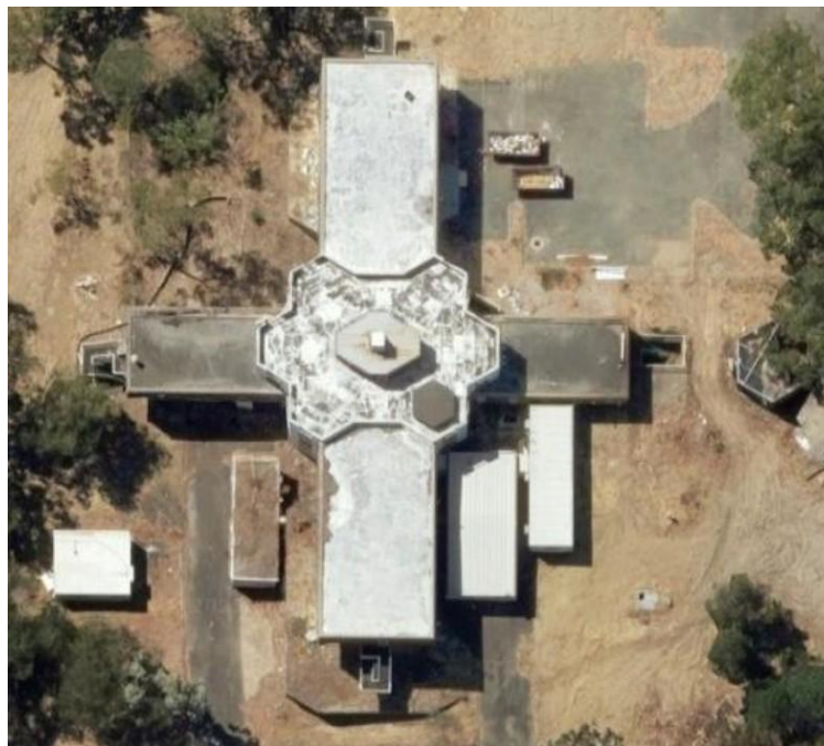
Aerial view of the 1970 Western Australian Herbarium and Herbarium Garden, corner of Hayman Road and George Street in Kensington.