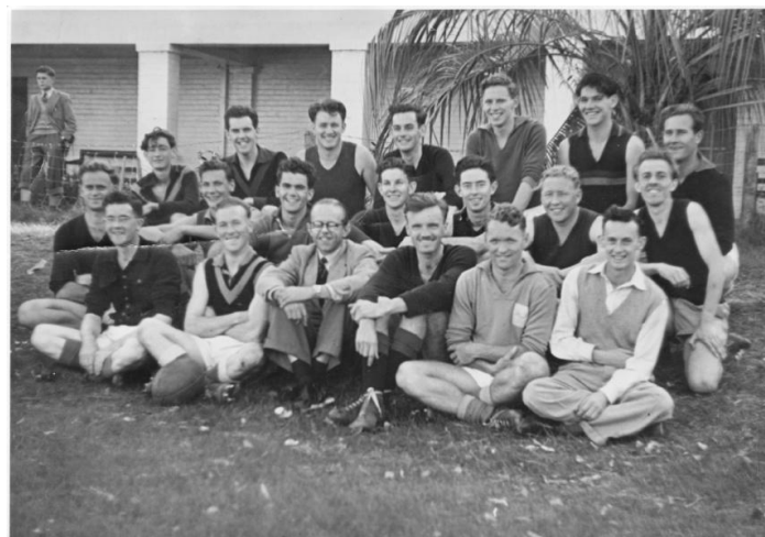
PTC School of Architecture football team 1952